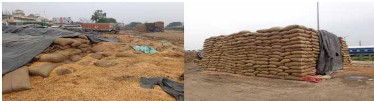
Figure 1: Unsecure stacking and wastage of maize at rail yards