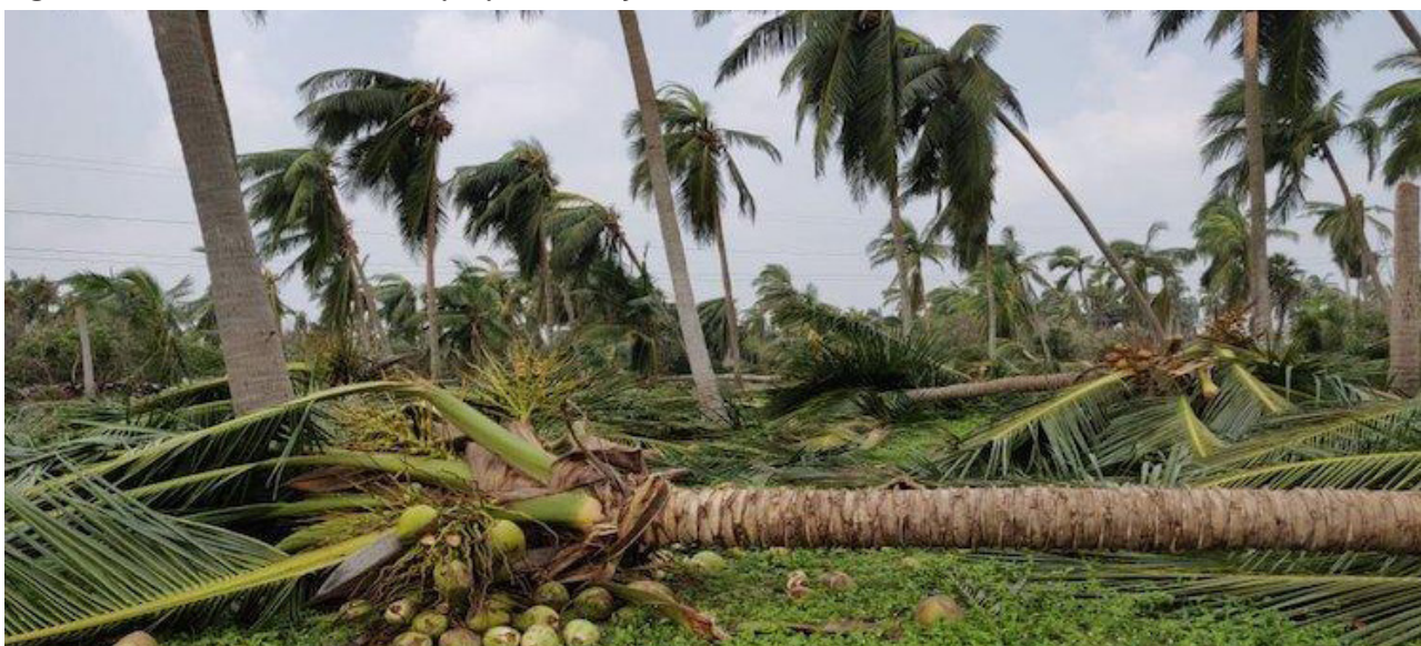
Figure 2: Destruction Caused by Cyclone Gaja in Tamil Nadu