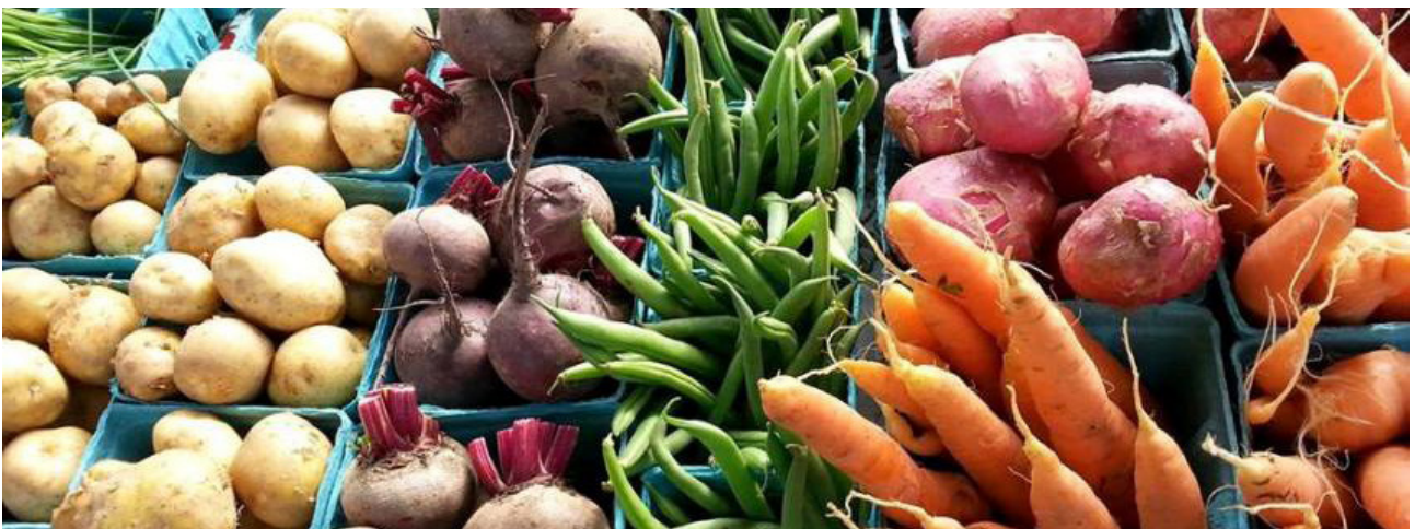
Figure 4: Organic Cultivation in Sikkim