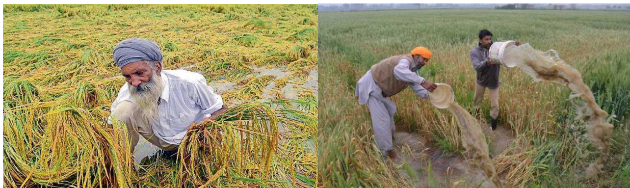
Figure 1: Destroyed Paddy Due to Unseasonal Rainfall