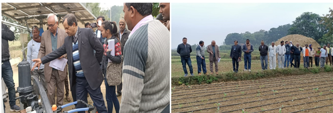
Figure 1: Implementation of PDMC Scheme: Field Survey in Sonbhadra District of Uttar Pradesh

occasional scarcity or excess water situation. The breakup of irrigated area as micro versus non-micro has been 66.86 percent and 33.14 percent respectively. In respect of rainfall, 82.29 percent of total MI adopters were subject to average rainfall, while 17.71 percent had heavy rainfall. Figure 1 below shows the glimpses from the survey conducted for the implementation of PDMC scheme in Sonbhadra district of Uttar Pradesh.